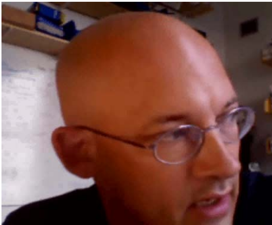
Clay Shirky – Author of “Here Comes Everybody”